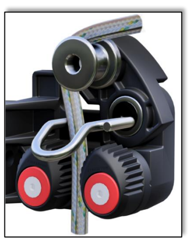
ANTI ROLLBACK MECHANISM (ARM)

Portable Winch Co. pulls off another master stroke in offering a winch that, while staying true to its predecessors