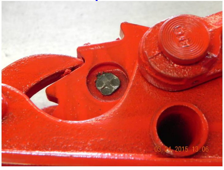
Rivet is peened down

After rivet is peened down, remove bolt.