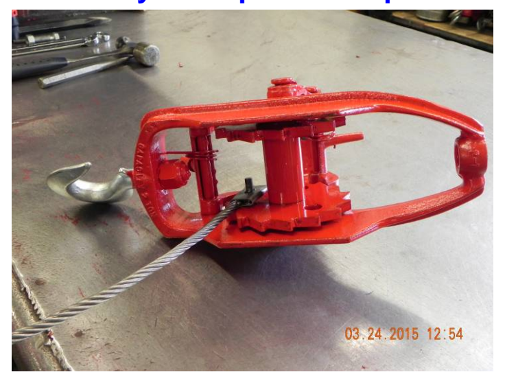
RF ready to be put thru top hole