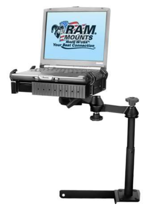
Complete Vehicle Mount RAM-VB-178-SW1

Website: www.ram-mount.com Email: staff@ram-mount.com